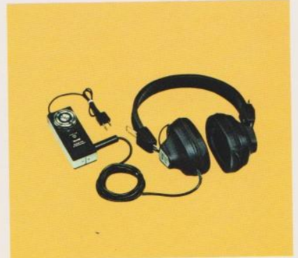
RB 9080 Stereocast adaptor package contains FM stereo amplifier, volume control, stereo indicator light and 8-ohm stereo headphones. No batteries required.