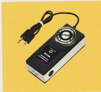
RB 9090 Stereocast Adaptor FM stereo amplifier, volume control, stereo indicator light. Jack for standard stereo headphones. No batteries required.