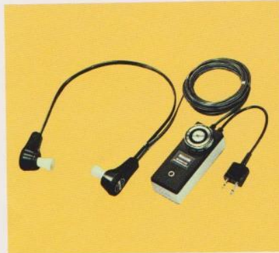
RB 9000 Stereocast adapter package contains FM Stereo amplifier, volume control, stereo indicator light and headphones. No batteries required.