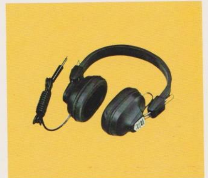
RB 9191 8-ohm Stereo Headphones.